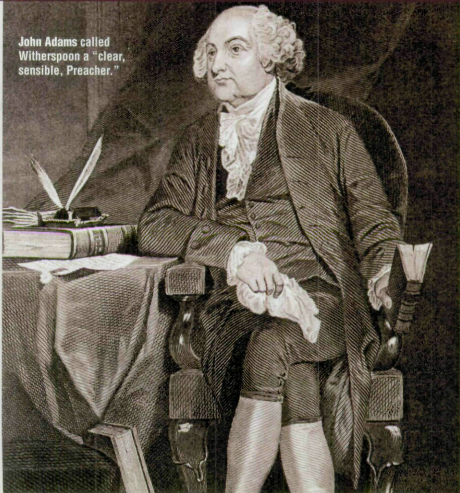
John Adams called Witherspoon a “clear, sensible, Preacher.”

life, he was blind and had to be led into the pulpit. When he died in 1794, his secretary wrote that his “descent into the grave was gradual and comparatively easy, free from any severe pain, and contemplated by himself with the calmness of a philosopher and the cheering hope of a christian.”